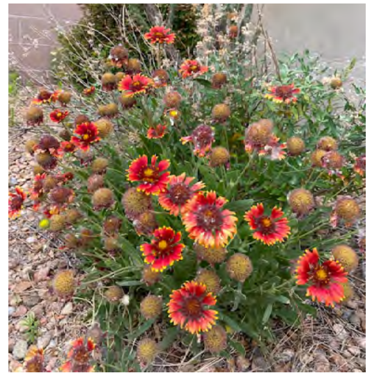
Blanketflowers ( Gaillardia sp.)