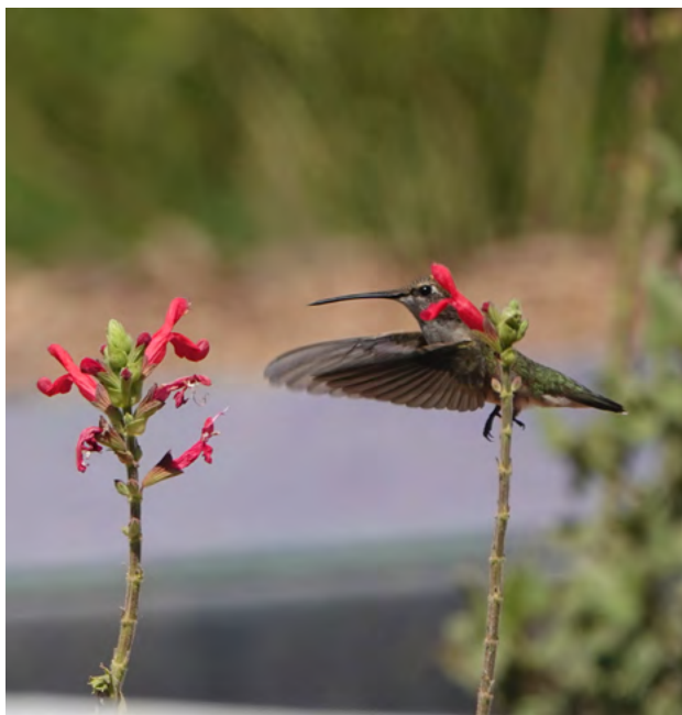
Black-chinned Hummingbird at Salvia darcyi

Please enjoy the space with your eyes instead of your feet while our baby plants grow!